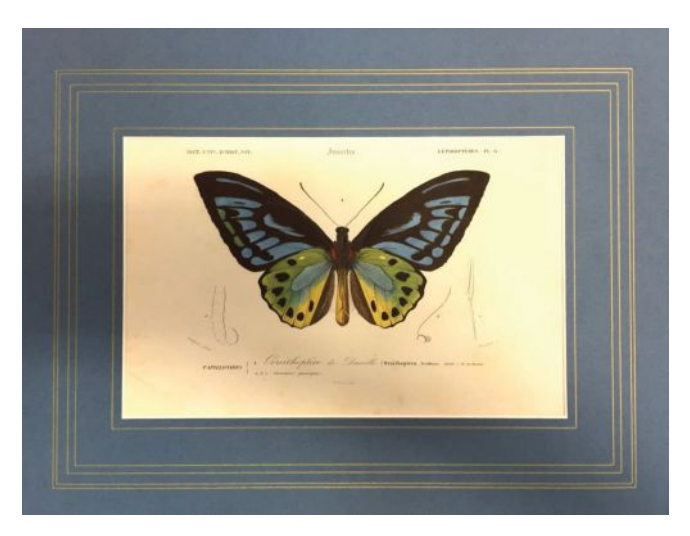
The five gold ink lines were drawn using a CMC and a 0.7mm Posca Paint Pen.