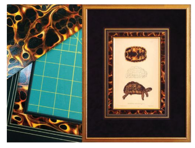
A wide-format printer was used to create this rich faux tortoise shell marbled paper. It was shellacked to add gloss.

Decorative paper enhances old prints beautifully, and don't