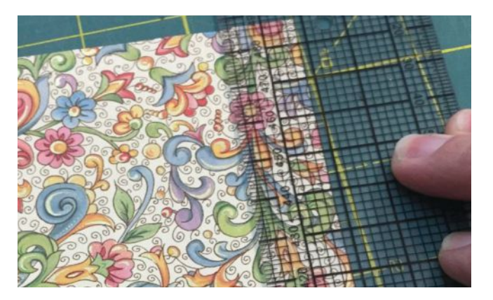
A quilter's ruler was used as a guide when cutting the decorative paper to size.

www.talasonline.com, and www.hollanders.com in a wide range of colors and textures. All three companies ship worldwide. Papers range from traditional marbled paper to modern free-form, textured, and printed papers. Antique sheet music or antique newspapers are also suitable and are inexpensive to buy online or at a local secondhand bookstore.