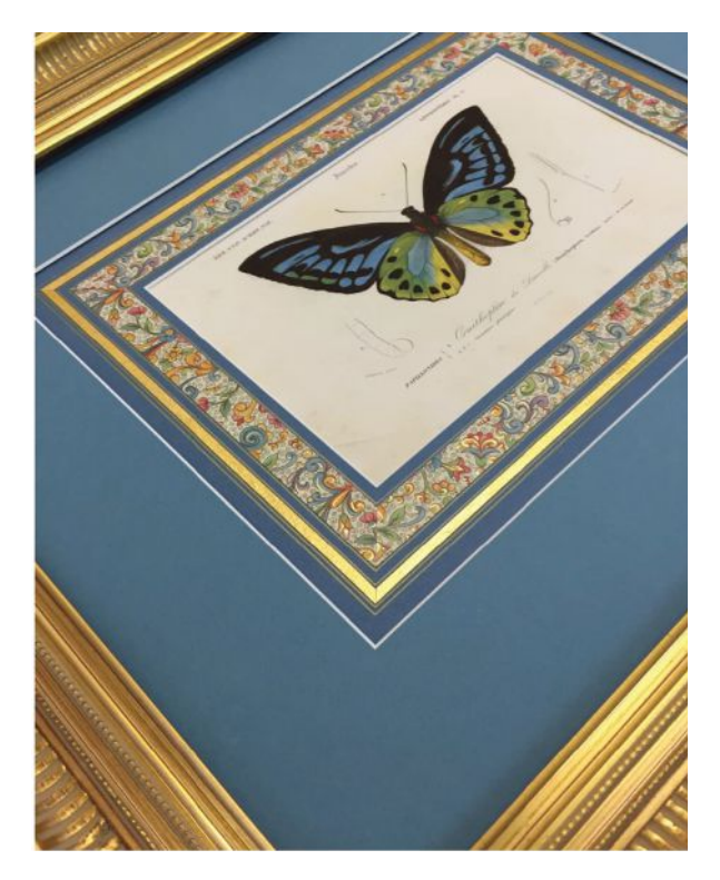
The right shade and pattern of decorative paper can enhance a piece of art and its frame perfectly.

The pen used in this example was a metallic gold Uniball Posca Marker PC-1MR 0.7mm. It is a pigment paint pen that produces a smooth, solid line of color. If a matboard is dark in color, the