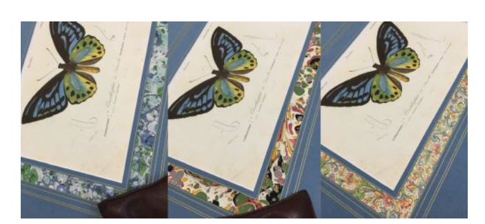
Three examples show different decorative papers. The printed Italian paper on the right was chosen for its softness and whimsy.

The paper in the example was cut into 18mm wide panels using a very sharp X-Acto knife. A quilter's ruler in mil-