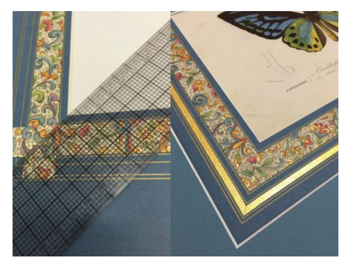
Adhere the decorative paper panels and gold leaf strips in place, then cut the corners diagonally.